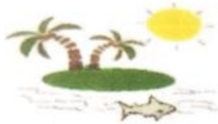
ODEMAP MOSQUERA SUR