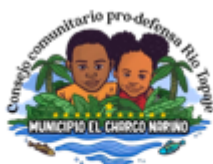
PRODEFENSA DEL RIO TAPAJE