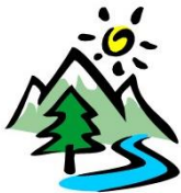
Ejido Chavarría Viejo